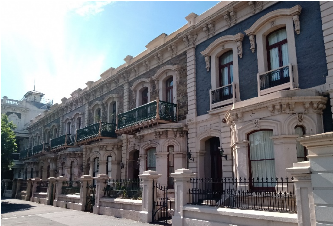
Botanic Chambers, North Terrace - 304 North Terrace is second from right